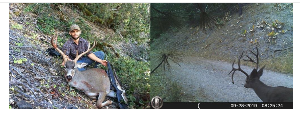
Success in the Field! On Site Habitat Improvement and Evaluation Project

Help restore our vanishing local blacktail herds! Make a difference in the "B" Zones!!